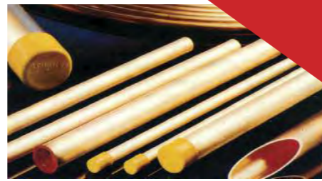
MEDICAL GAS NETWORK