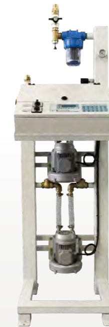
ANAESTHETIC GAS SCAVENGING SYSTEMS