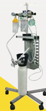
SECONDARY MEDICAL EQUIPMENT