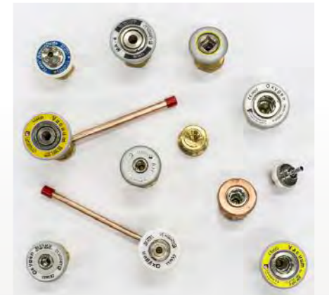
MEDICAL GAS TERMINAL UNITS / OUTLETS