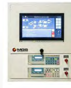
MEDICAL GAS ALARM SYSTEMS