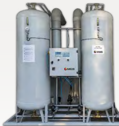
OXYGEN NITROGEN GENERATORS