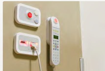
NURSE CALL SYSTEMS