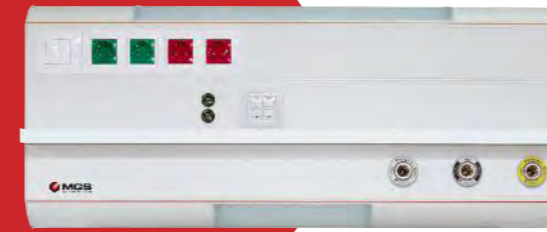
BED HEAD UNITS