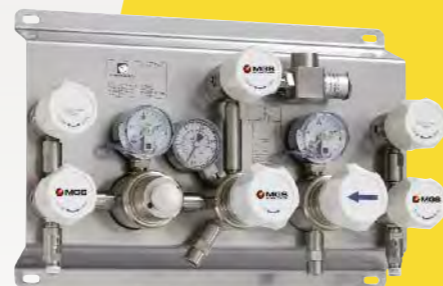
PATHOLOGY LABORATORY GAS SYSTEMS