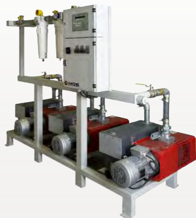
MEDICAL VACUUM SYSTEMS