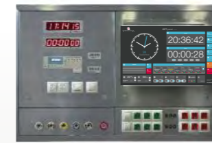
OPT CONTROL PANELS