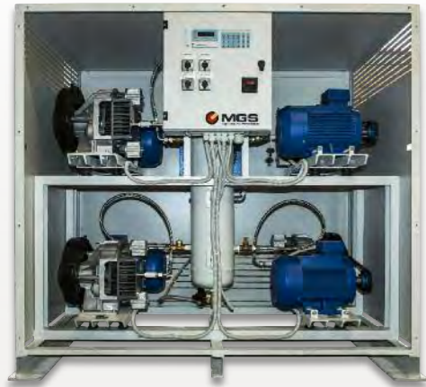
MEDICAL AIR COMPRESSOR SYSTEMS