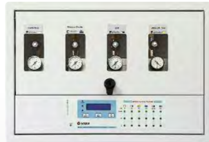
2nd STAGE CONTROL & REDUCE PANELS / AREA VALVE SERVICE UNITS